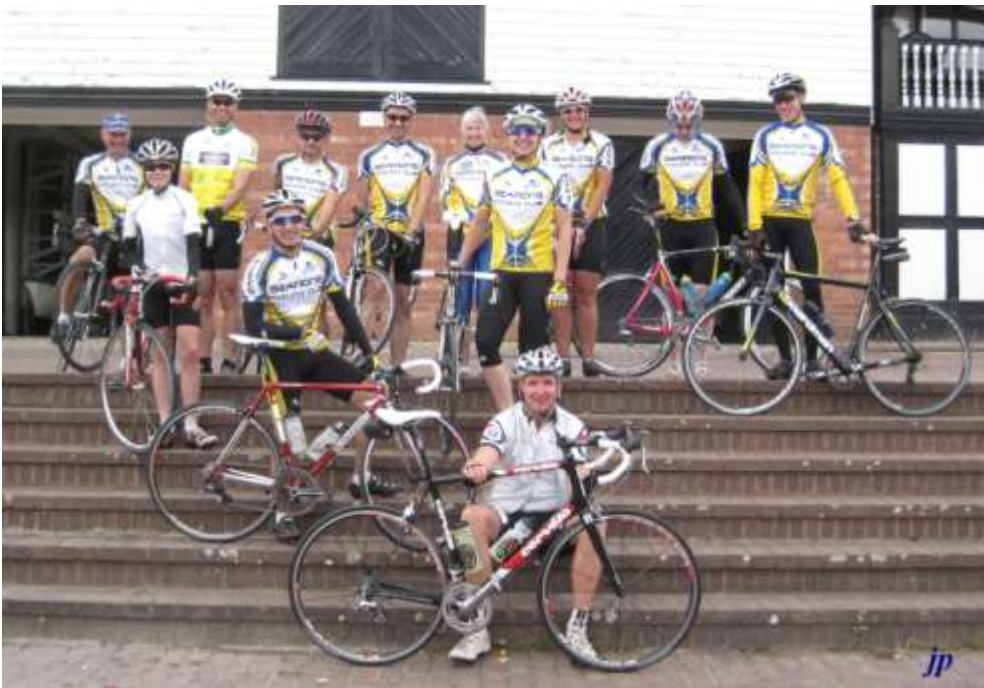
The Half-day group (above)