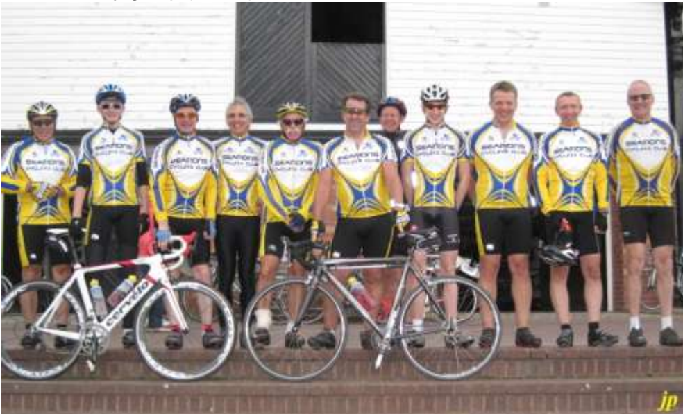
The Tempo group's two halves (above & below)